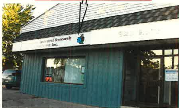
926 High Street Peterborough, Ontario

OPEN 1 - 5 P.M. TUESDAY THROUGH SATURDAY